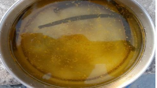
Materials for JalaukavacharanaVidhi Activation of Jalauka with Haridra